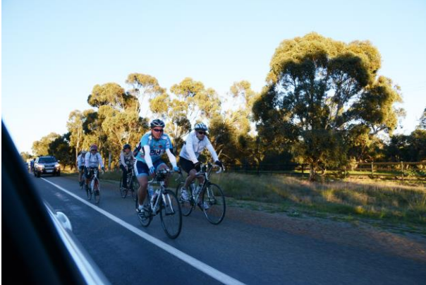
Tour of Toodyay 2013....

Ever dreamed of doing an event where you had your own Team Car to carry all of your spares, your food supplies and change of clothing? Well you can now with the Team car component for the Tour of Toodyay.