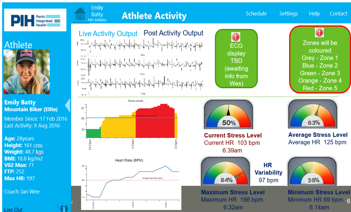
View of the Athlete's personalised dashboard.

Users outside of Perth within Australia will soon have appointed Sports Medicine clinics throughout the country and overseas users can also source Sports Medicine clinics which will be licensed by us to use the same technology.